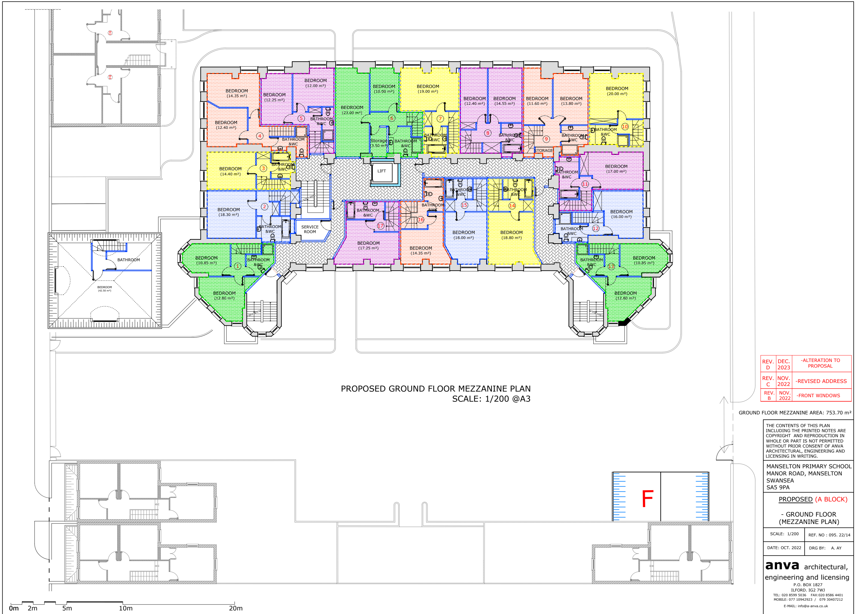
PROPOSED GROUND FLOOR MEZZANINE PLAN SCALE: 1/200 @A3