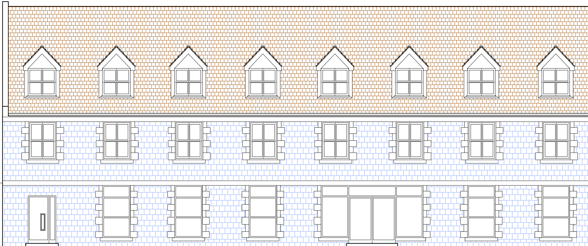
PROPOSED FRONT ELEVATION SCALE: 1/100 @A3