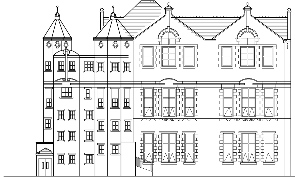
PROPOSED SIDE ELEVATION SCALE: 1/200 @A3