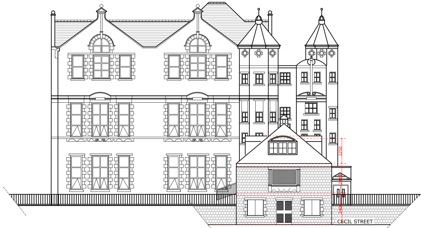
PROPOSED SIDE ELEVATION SCALE: 1/200 @A3